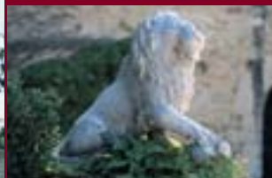
Julien bridge (Bonnieux)