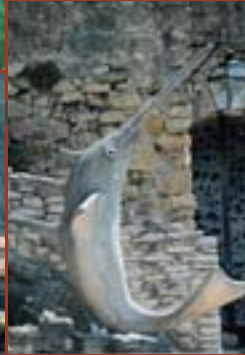
Door of the Tour d'Aigues castle